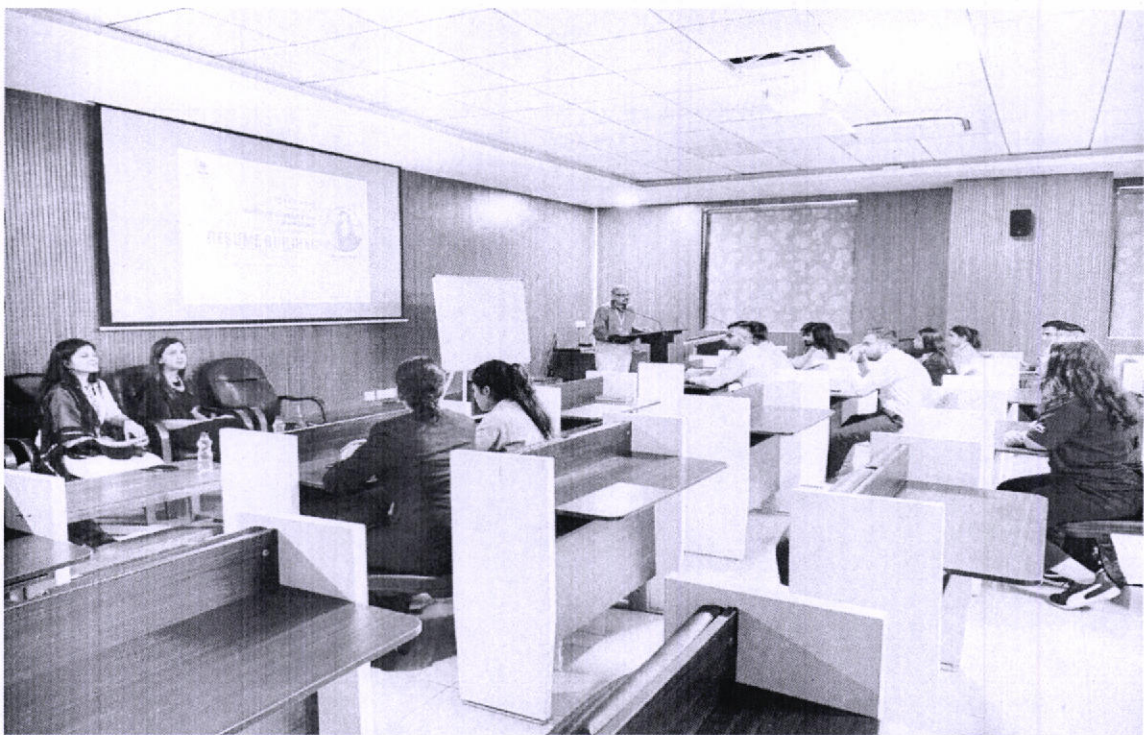
Activity Done by the students