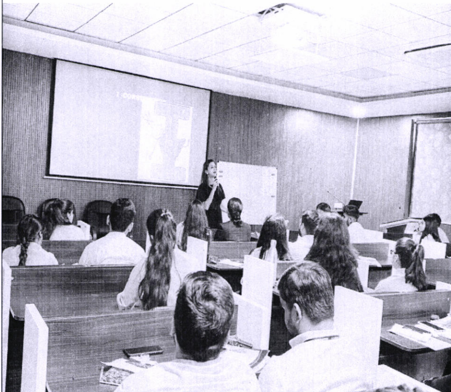
Students listening to the insightful talk delivered by the speaker